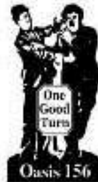
Oasis 156 Sons of the Desert